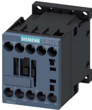
Contactor relay, 2 NO + 2 NC, 24 V DC, Size S00, screw terminal